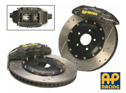
Part# AP1600 (Black Caliper / Yellow Script)